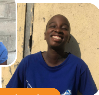
Basic Secondary School